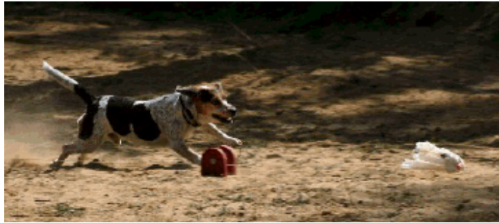
Bear is obsessed with lure coursing!

Lure Coursing - A sight hound sport that encourages the dog to chase a fast moving object (usually a plastic bag tied to a string loop) around a course. In competition, only sighthounds can compete, but some clubs allow other breeds on fun runs and any dog can try it at Dog Scout camp! The red object in the photo below is the guide for the string so it can be laid out in a big loop. The string and the object tied to it are driven by a variable speed drive wheel.