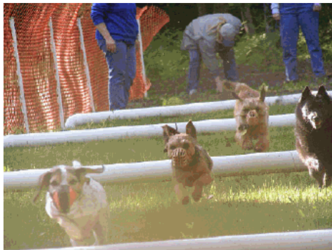
Bear the beagle loves steeplechase too! And he's FAST!

Steeplechase : This is the terrier's version of lure coursing, but any breed can try it at Dog Scout camp! It involves a straight, fenced course and low jumps. The same lure is used as in lure coursing. Several dogs run at once and at the end, find a small opening between hay bales which is only large enough for one dog at a time to pass through. First dog through wins! The dog's wear muzzles to prevent them from using aggression to win or after they get through the opening and can't find the lure.