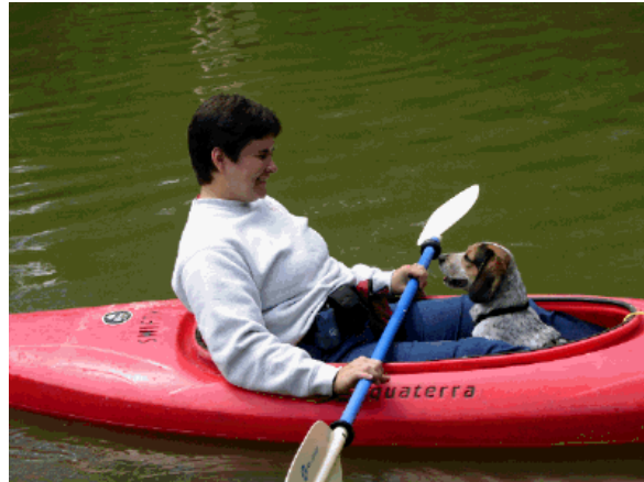
Bear loves to kayak!