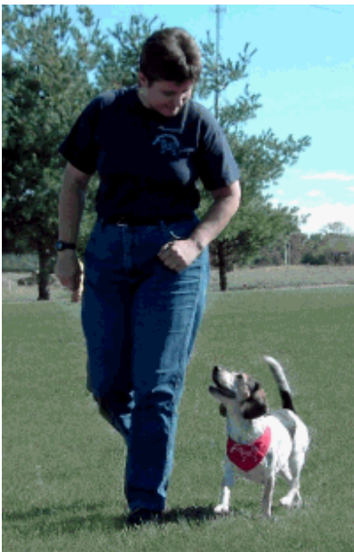
Obedience Trials - Dogs are judged on their precision and response to cues.

Tracking - Dogs using their nose looking for various items over various terrain