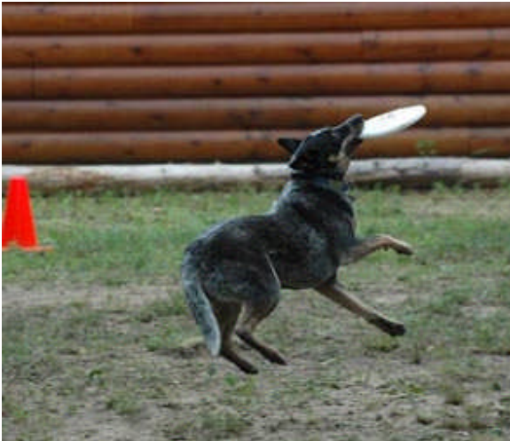
Coyote during competition

Frizbee - Does your dog love to catch a frizbee? Perhaps he or she can compete for distance or free style! Even if you choose not to compete, catching a frizbee is something many dogs enjoy.